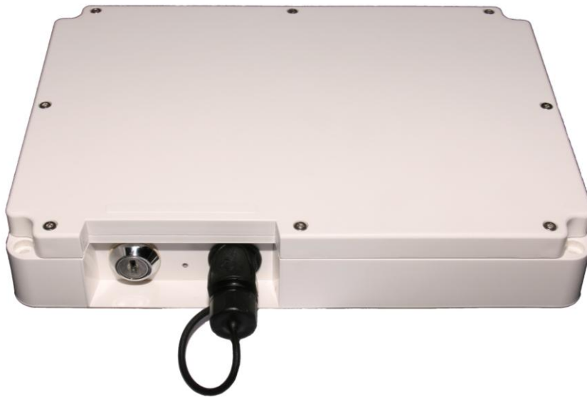
Figure 2-1: TAM-242 Tracking and Monitoring Equipment

The TAM-242 (Figure 2-1) is a compact, low data rate, satellite terminal designed to operate over the INMARSAT satellites for use in tracking assets that have no integral power source. The terminal uses the INMARSAT IsatM2M protocol and provides global coverage and fully automatic roaming across all of the world's ocean regions, see Location on page 6 for more information.