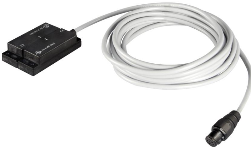
Figure 2-2: TAM-252 Proximity switch and actuator

The proximity switch is mounted on the end of a cable that mates with the front panel connector on the TAM-242 unit. The actuator is a separate item that must be mounted so that in normal operation it is located next to the proximity switch.