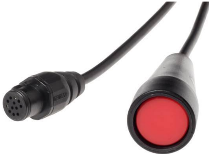
Figure 2-3: TAM-262 Panic button cable

The panic button is mounted on the end of a cable that mates with the front panel connector on the TAM-242 unit. See Figure 2-3.