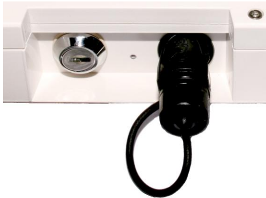
Figure 3-3: Key Switch On Position

Turn the key switch to the on position. When switching the terminal on, the LED will start to flash 1 second on, 2 seconds off until a position report has been sent or it has timed out (up to 10 minutes).