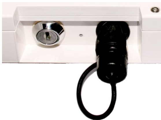
Figure 3-4: Key Switch Off Position

Turn the key switch to the off position. The LED will switch on for 6 seconds then switch off. The terminal is now in the off state and will not transmit position reports until switched back on.