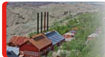
In Building - PBX Integration